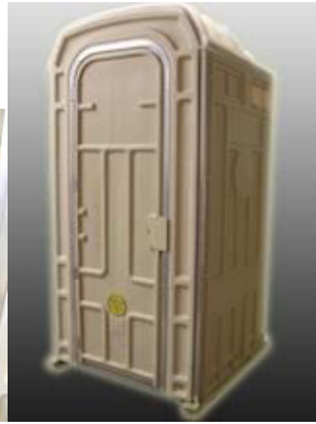
SJSDCS 520 Comfort Station