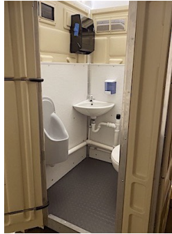
Waterless Urinal Option