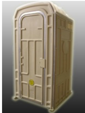
SJSDCSS 520 Comfort Station